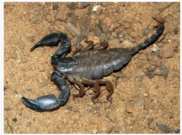
Opistacanthus validus (Family Hemiscorpidae)

For more information on ICZN go to http://www.iczn.org/