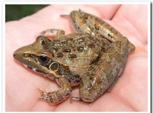
This frog species holds the world record for distance jumping—9m in three leaps. What is it?

Malcolm Douglas V27 Highlands Farm Vergenoeg Road White River Mpumalanga